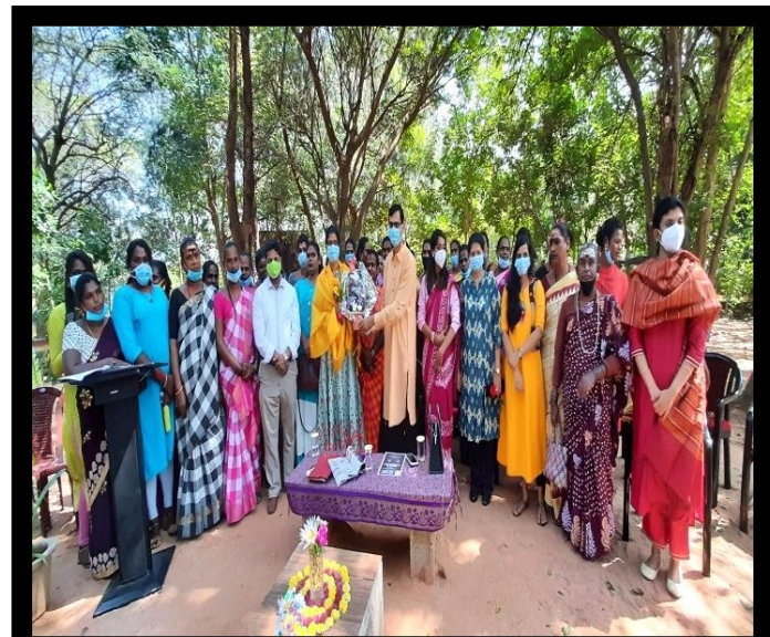
Program with Transgender