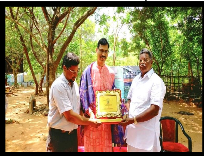
Hon'ble Deputy Speaker Shri. P. Rajavelu Government of Puducherry