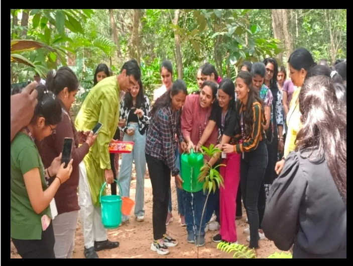
Staff & Students of Sri Kanyaka Parameswari Arts & Science College for Women, Chennai