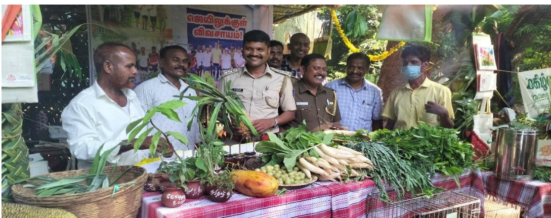
Our Alumni and Guests – Seed Mela was Open to All