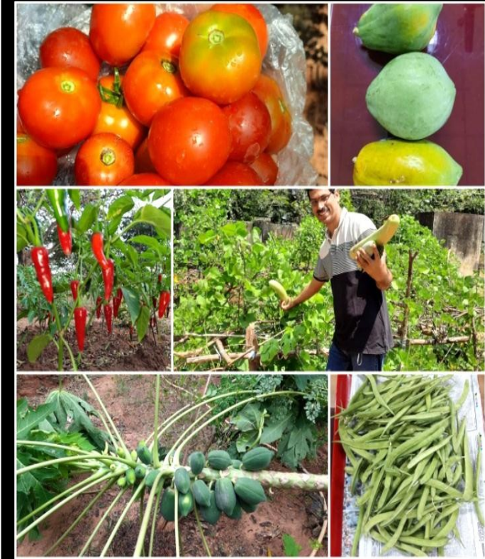
Organic Vegetables in our College Campus