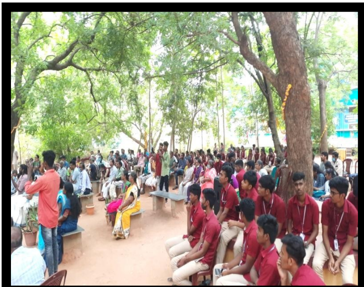
Program with Farmers and other College Students