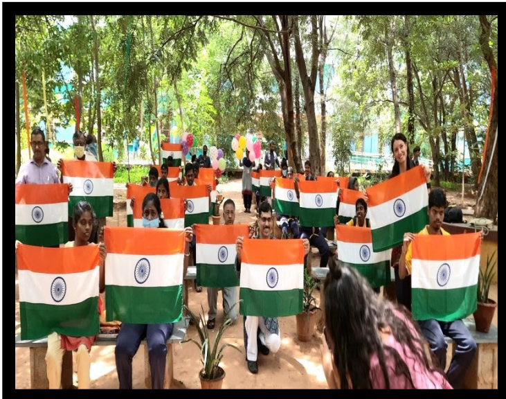
Program with School Children