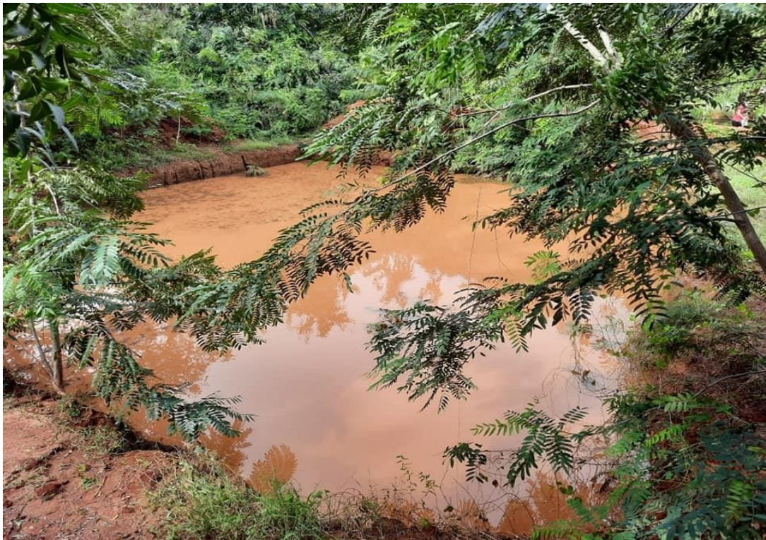
Water Recharging Pit (2022)