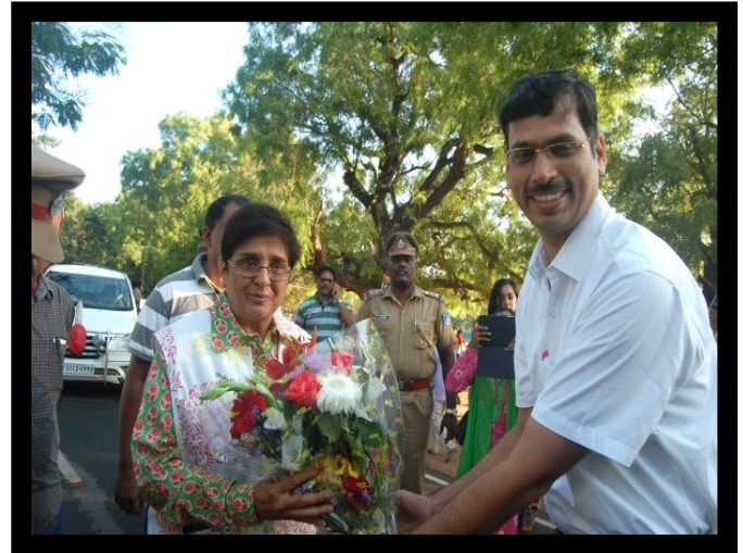
Hon'ble Former Lt. Governor Dr. Kiran Bedi Government of Puducherry