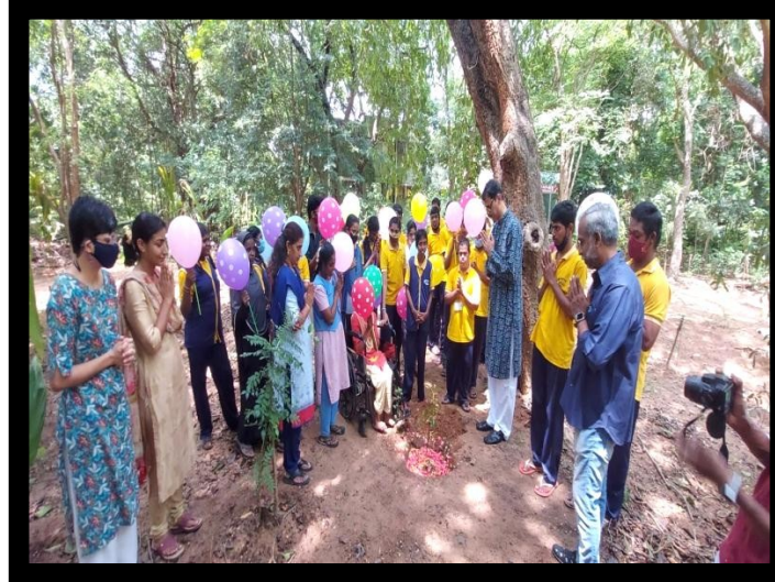
Staff & Students of Satya Special School, Puducherry