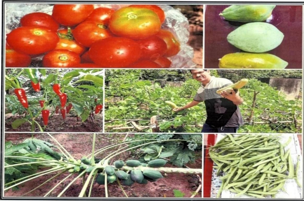
The Fruits Of Our Labour !