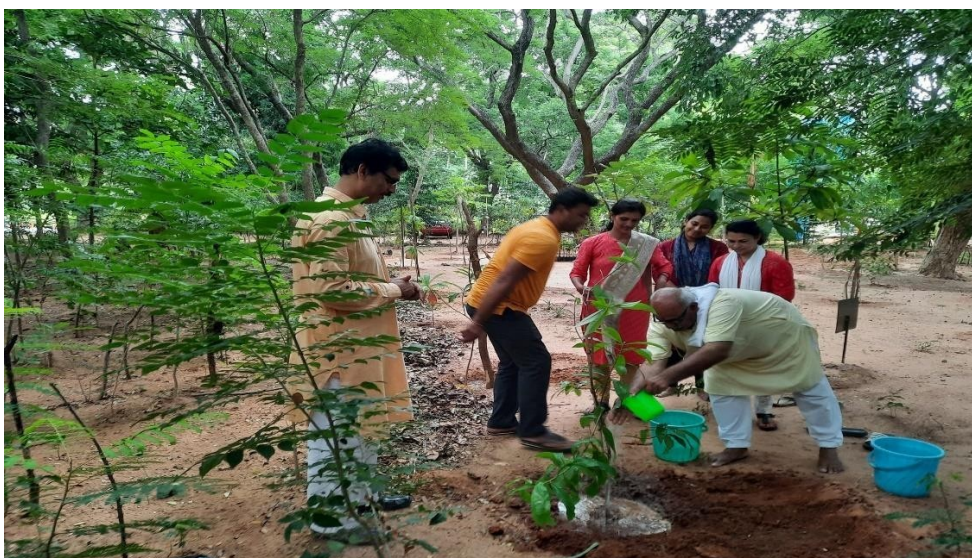
Eager to Forge India