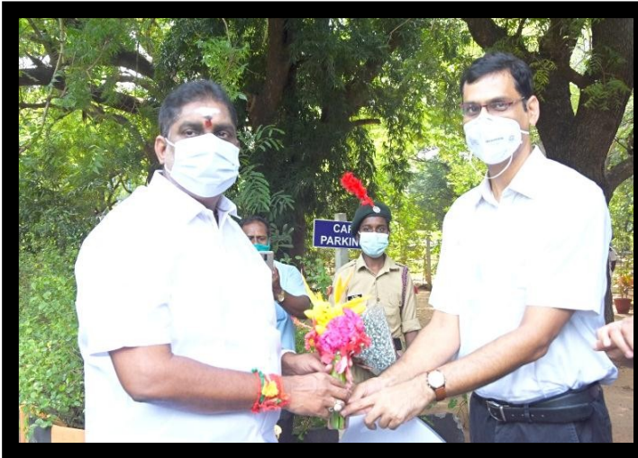
Hon'ble Minister for Home Shri. A. Namassivayam Government of Puducherry