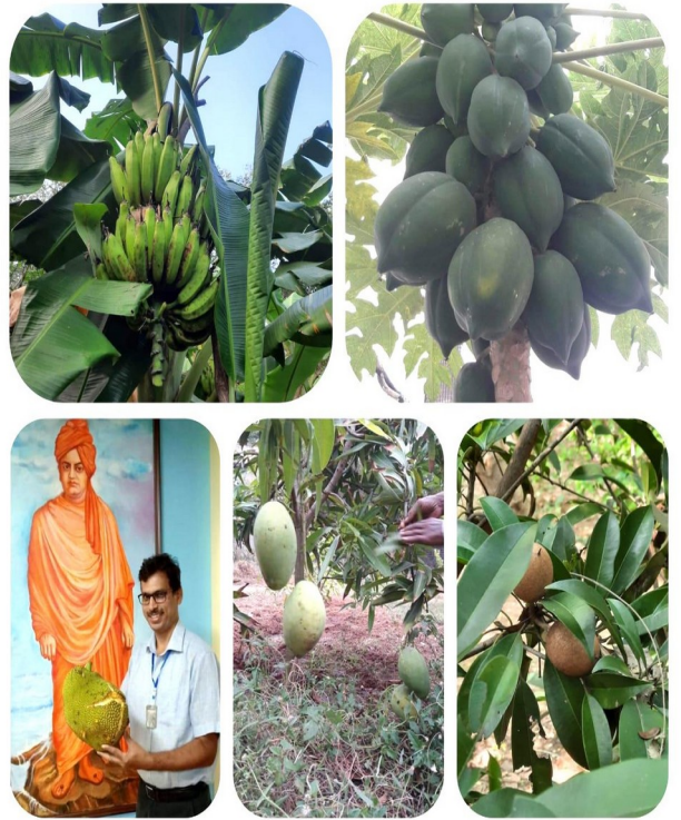
Organic Fruits in our College Campus