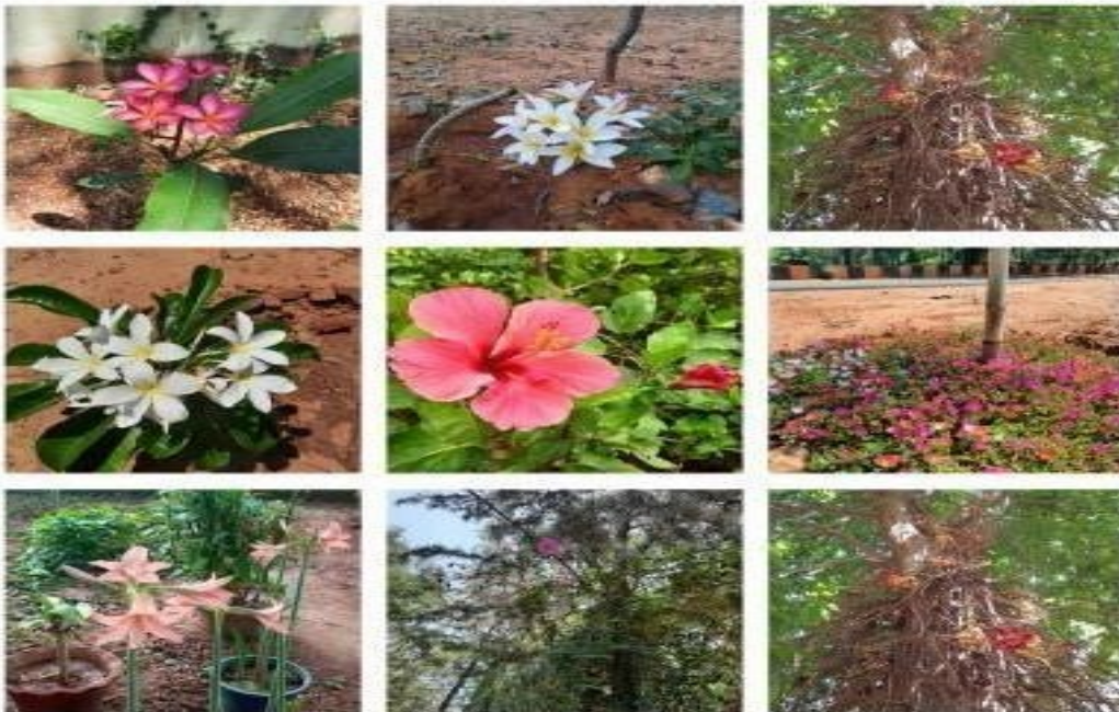
“Flowers Don’t Tell, They Show”