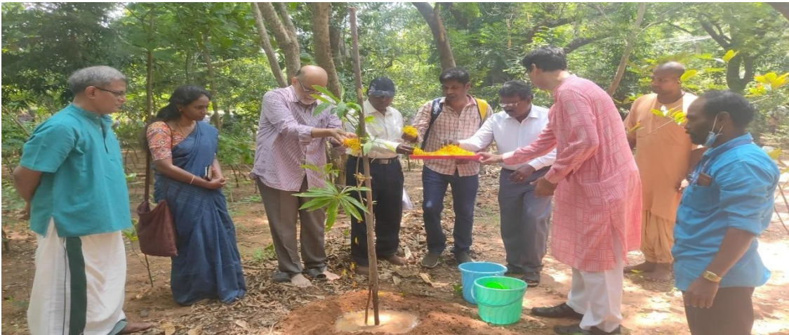
Plantation Drive -Seed Mela