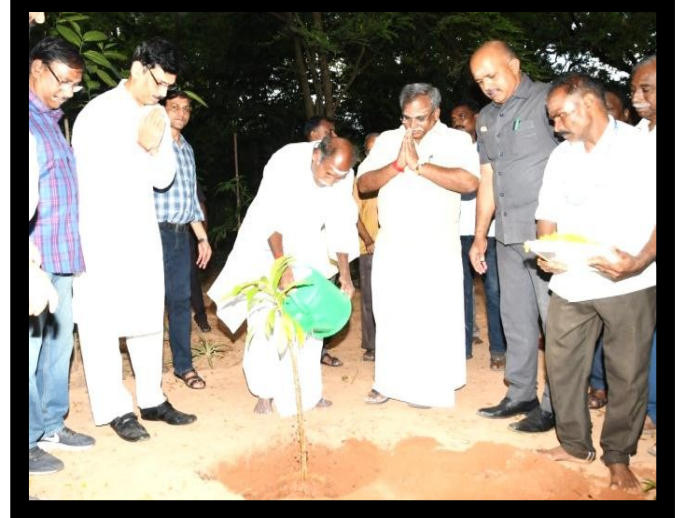
Hon'ble Chief Minister Shri. N. Rangasamy & Hon'ble Speaker Shri. Embalam Selvam Government of Puducherry