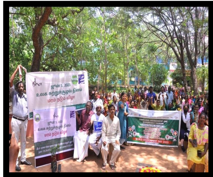
Program with Community