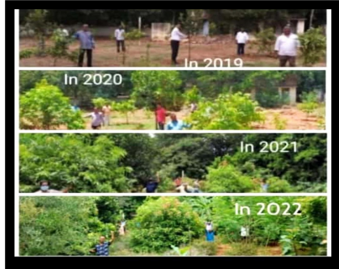
Since 2019 to 2022