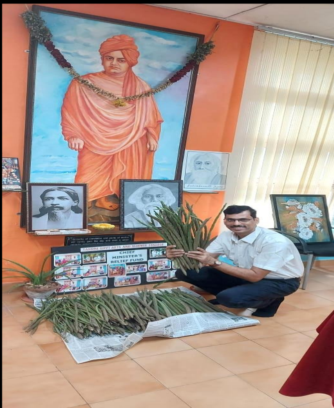
Organic Drumsticks in our College Campus