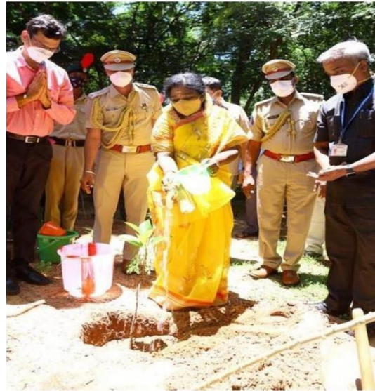
Lt. Governor Tamilisai Soundararajan during the visit to the Tagore Government Arts and Science College on Tuesday.

Puducherry L-G urges youth to embrace environmentalism