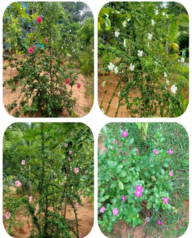
Flowers in our College Campus