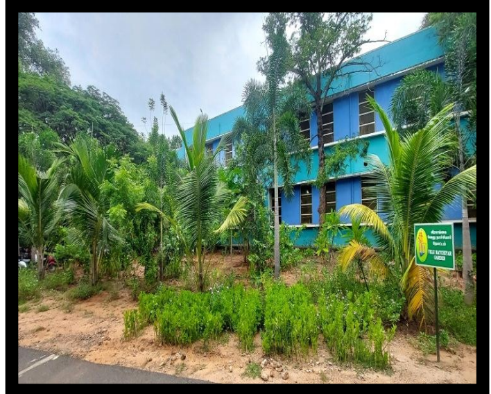
VEERA MANGAI VELU NATCHIYAR GARDEN