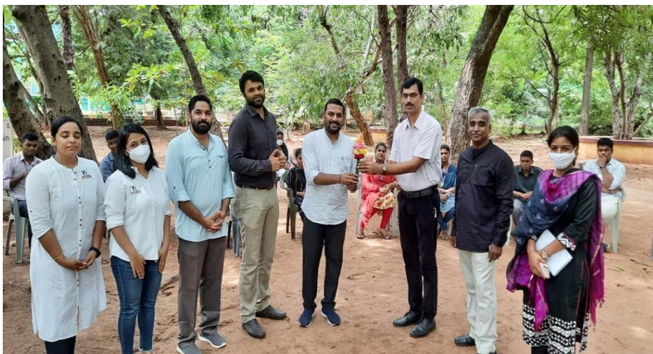
CII, Young India