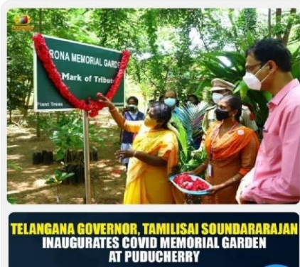
TELANGANA GOVERNOR, TAMILISAI SOUNDARARAJAN INAUGURATES COVID MEMORIAL GARDEN AT PUDUCHERRY

#TamilisaiSoundararajan #COVIDMemorialGarden #Puducherry #MangoNews