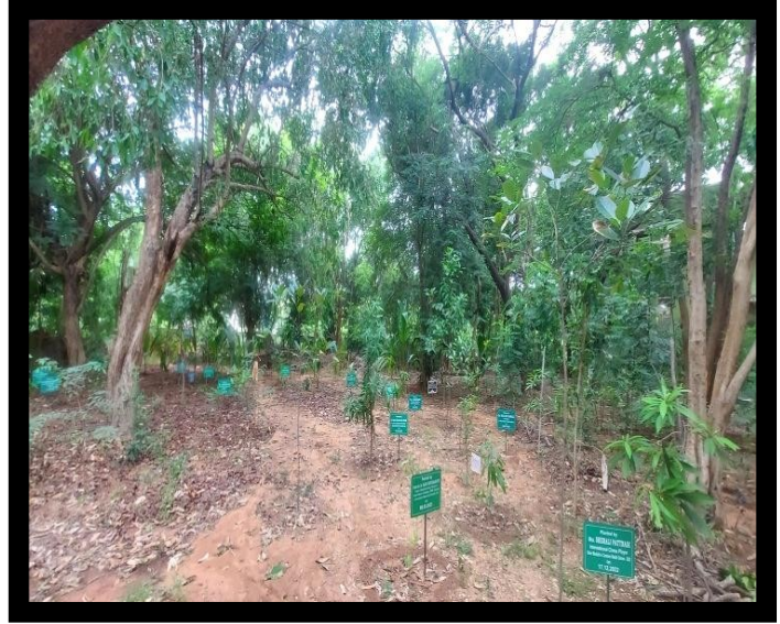
CORONA MEMORIAL GARDEN