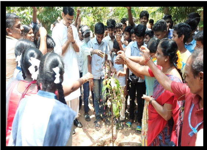
Staff & Students of Government High School, Mangalam, Puducherry