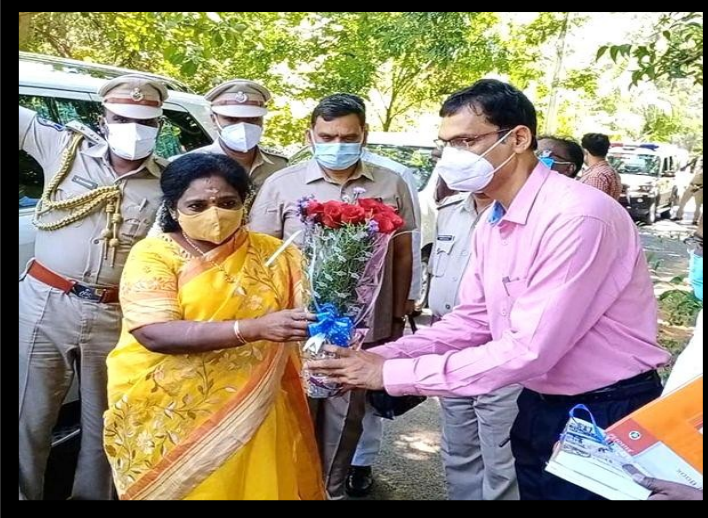
Hon'ble Lt. Governor Dr. Tamilisai Soundararajan Government of Puducherry